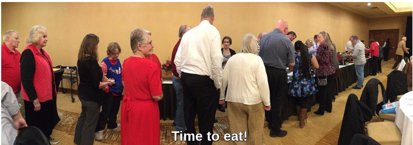
Time to eat!